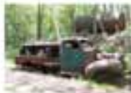
AT POST #5