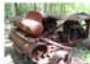
AT POST #12