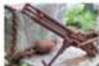
AT POST #1