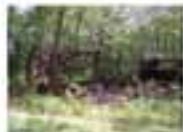
AT POST #7