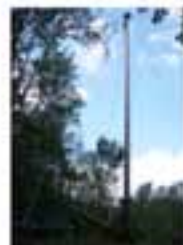
AT POST #14