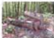
AT POST #8